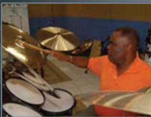
Ademir Batera (Fundo de Quintal)