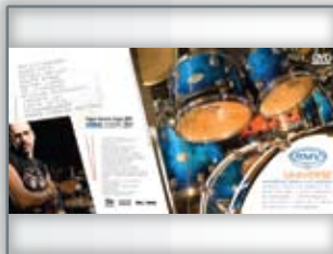
DVD RMV Universe