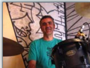
(Gilberto Gil)