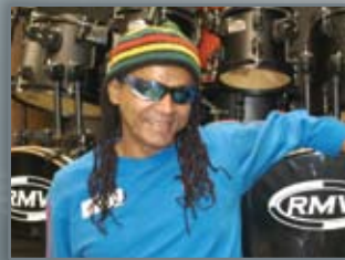
Joãozinho (Tribo de Jah)