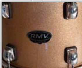
27 Champagne Sparkle